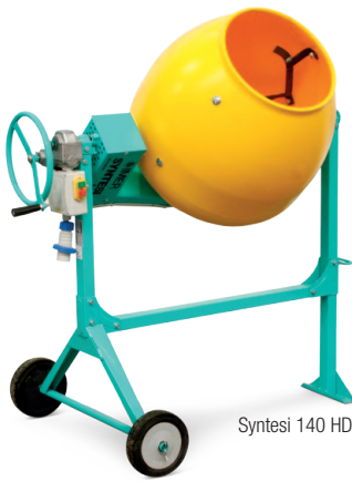
Syntesi 140 HDPE